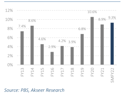
Chart-2: Core Inflation Trend